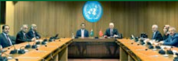
Reviving Multilateralism for a Just and Peaceful World: Pakistan's Call at the 6th World Conference of Speakers of Parliament, 29th July to 31st July 2025 - Geneva