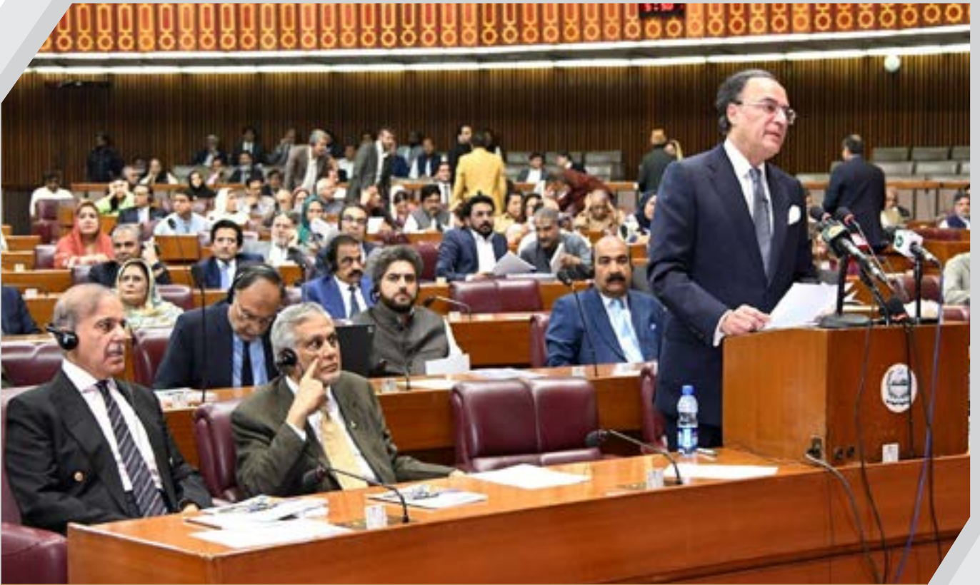
National Assembly Session Highlights: Finance Minister Senator Muhammad Aurangzeb Presents Federal Budget 10th July 2025 – Parliament House, Islamabad