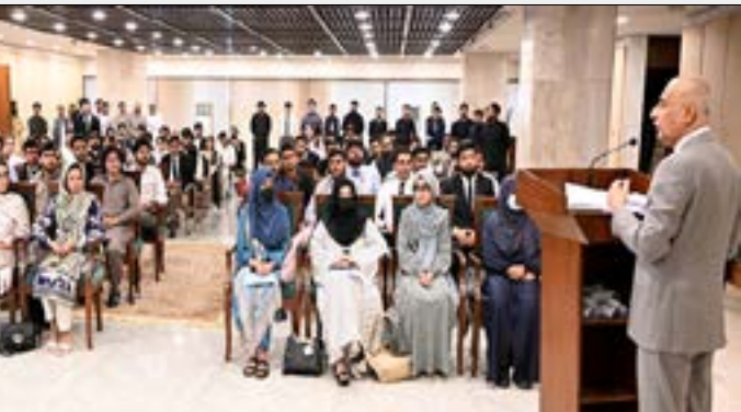
Speaker National Assembly Sardar Ayaz Sadiq addressing the interns of the National Assembly Secretariat on 16th June, 2025 at Parliament House.