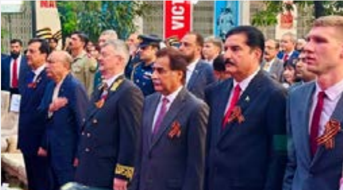
Speaker National Assembly, Sardar Ayaz Sadiq, attended a ceremony at the Embassy of the Russian Federation to mark the 80th Anniversary of Victory in the Great Patriotic War on 7th May, 2025 at Islamabad.