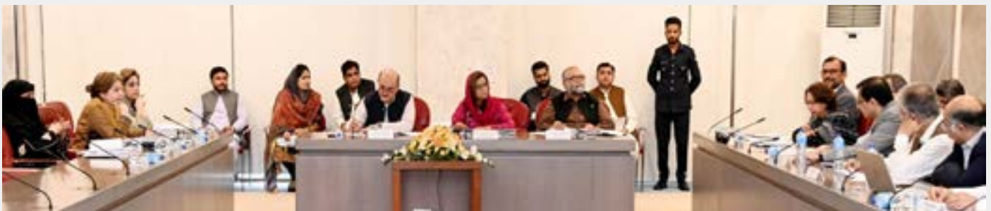
Chairperson, Special Committee on Gender Mainstreaming Dr. Nafisa Shah chairing the committee meeting at Parliament House on 2nd May, 2025

was guided by the National Gender Policy Framework, which prioritizes governance, education, economic empowerment, political participation, health, and safety.