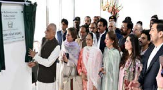
Speaker National Assembly Sardar Ayaz Sadiq inaugurating the Parliamentarians Coffee Corner by Third Culture Coffee on 20th June, 2025 at Parliament House.