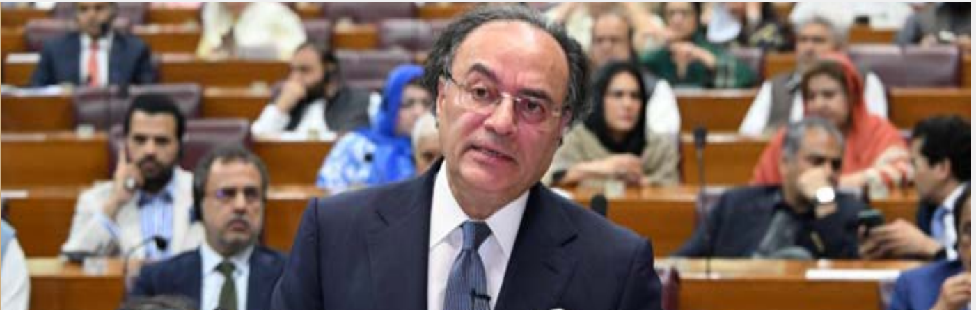
Finance Minister Senator Muhammad Aurangzeb presented the budget during the budget session on June 10, 2025, at Parliament House, Islamabad.

Senator Muhammad Aurangzeb, Minister for Finance and Revenue, presented the Federal Budget 2025-26 in the 16th National Assembly on June 10, 2025. The House adopted a motion under Rule 288 to suspend certain rules, enabling extended budget deliberations.