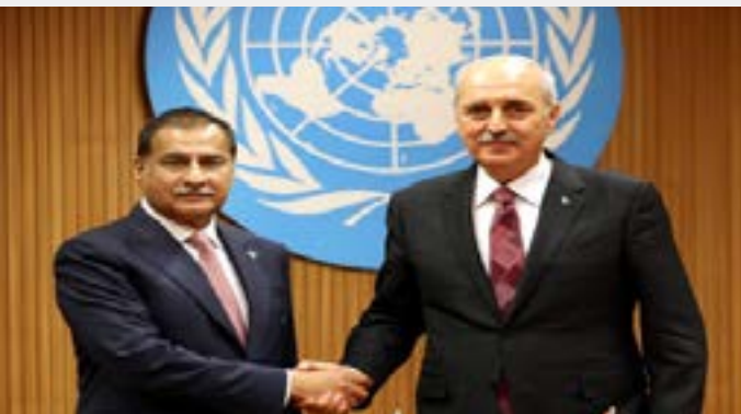
Speaker National Assembly Sardar Ayaz Sadiq met with the President of the Turkish Grand National Assembly, Mr. Numan Kurtulmus on the sidelines of the 6th World Conference of Speaker of Parliament on 30th July, 2025 at Geneva.