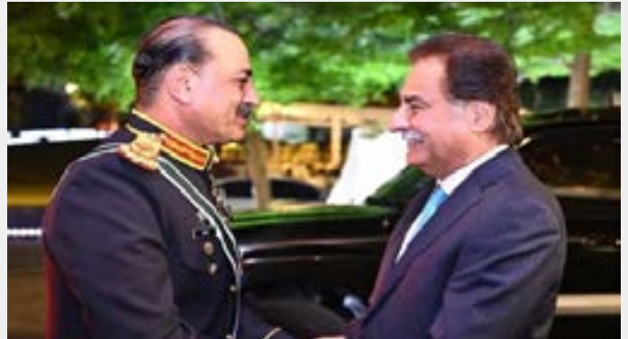
Speaker National Assembly Sardar Ayaz Sadiq attended a dinner hosted by Field Marshal Syed Asim Munir in honor of the country's political and military leadership on 24th May, 2025 at Islamabad.