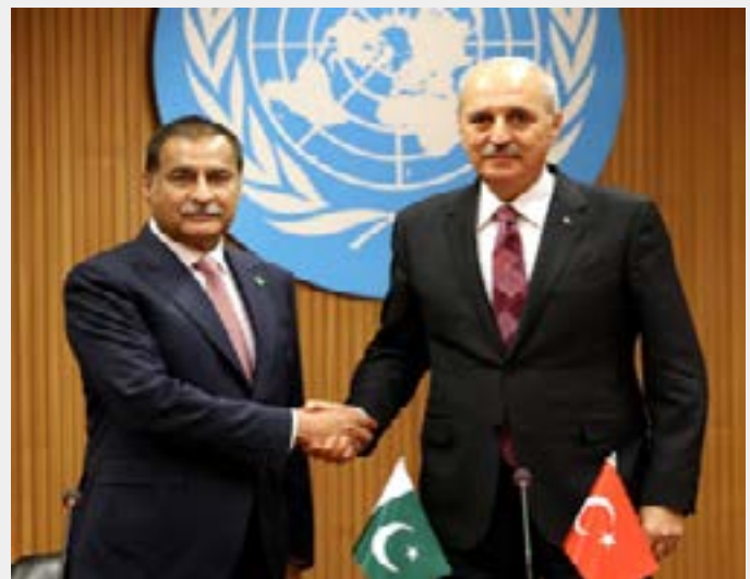
The Speaker National Assembly Sardar Ayaz Sadiq met with the President of the Turkish Grand National Assembly, Mr. Numan Kurtulmus on the sidelines of the 6th World Conference of Speakers of Parliament in Geneva on 30th July, 2025.

He stressed the urgent need to reform the UN system, particularly the Security Council, to make it more democratic, transparent, and responsive to current challenges. In conclusion, Speaker Sardar Ayaz Sadiq stated: "The world has witnessed enough bloodshed. It is time for new thinking – to embrace pluralism, respect diversity, and work collectively for a peaceful and just future."