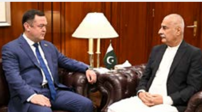
Ambassador of Uzbekistan Mr. Alisher Tukhtaev called on Speaker National Assembly Sardar Ayaz Sadiq on 17th June, 2025 at Parliament House.