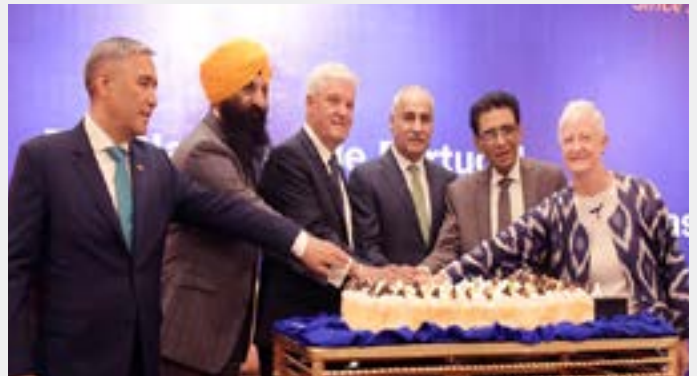
Speaker National Assembly Sardar Ayaz Sadiq cutting cake as a Chief Guest on National Day of the Republic of Portugal on 17th June, 2025 at Islamabad.