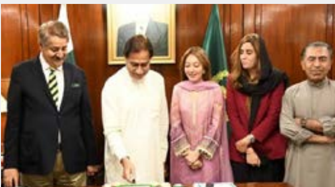
Members of the National Assembly called on Speaker Sardar Ayaz Sadiq and appreciated his role in conducting the proceedings of the House in an effective, orderly, and impartial manner on 20th May, 2025 at Parliament House.