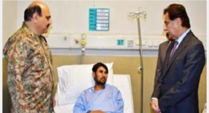
Speaker National Assembly Sardar Ayaz Sadiq visited CMH Rawalpindi to inquire about the wellbeing of those injured in the aftermath of the shameful Indian attack on Pakistan in 14 May, 2025 at Rawalpindi.