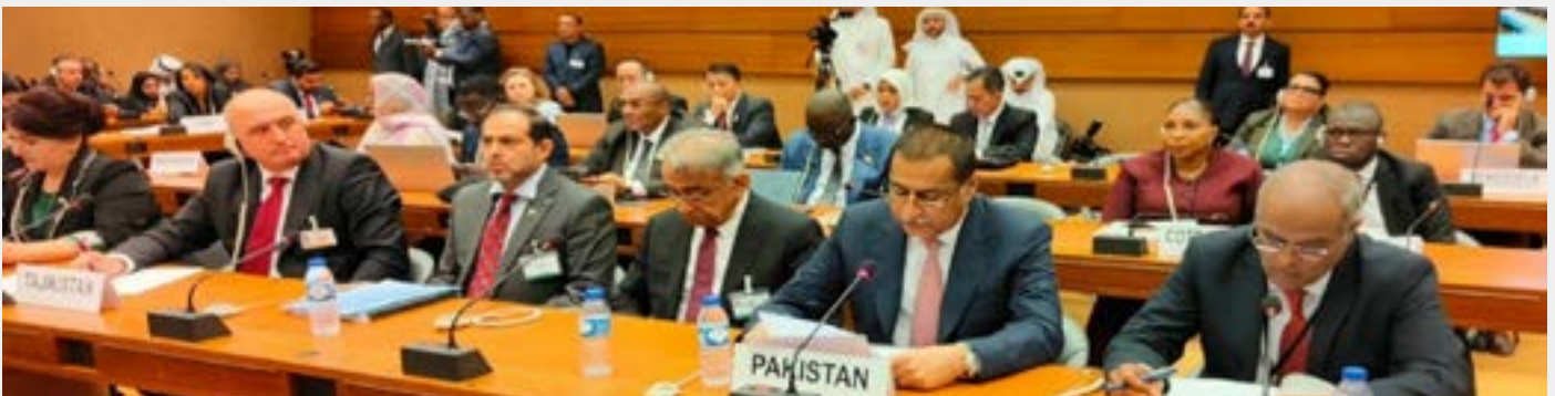
Reviving Multilateralism for a Just and Peaceful World: Pakistan's Call at the 6th World Conference of Speakers of Parliament 29th July to 31st July 2025 - Geneva

Honourable Speaker National Assembly of Pakistan, Sardar Ayaz Sadiq, participated in the Sixth World Conference of Speakers of Parliament in Geneva, where he reaffirmed Pakistan's commitment to peace, sovereignty, multilateralism, and the principles of the United Nations Charter.