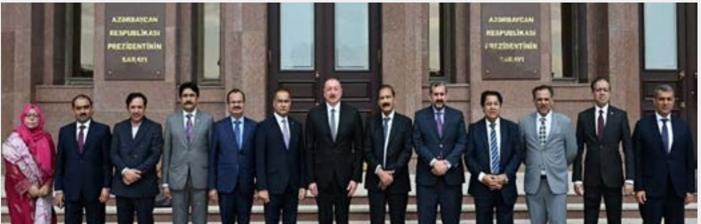
Pakistan's Parliamentary Delegation led by the Speaker National Assembly visited the President House of the Republic of Azerbaijan on 7th July, 2025.

At the conclusion of the visit, Speaker Ayaz Sadiq inscribed his remarks in the guest book of the Milli Majlis, affirming Pakistan's deep respect for the friendship between the two nations. Both parliaments reiterated their commitment to strengthening institutional collaboration, promoting people-to-people ties, and advancing parliamentary diplomacy as a cornerstone of bilateral and regional cooperation.