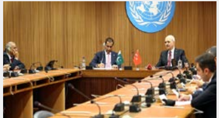
Speaker National Assembly Sardar Ayaz Sadiq in a meeting with the President of the Turkish Grand National Assembly, Mr. Numan Kurtulmus on the sidelines of the 6th World Conference of Speaker of Parliament on 30th July, 2025 at Geneva.