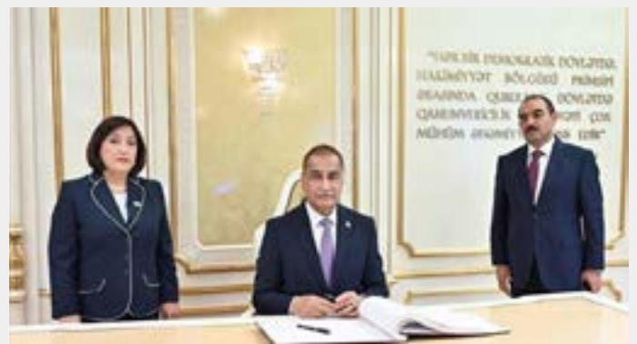
Speaker National Assembly Sardar Ayaz Sadiq inscribed his remarks in the guest book of Milli Majlis of the Republic of Azerbaijan on 7th July, 2025 at Baku, Azerbaijan.