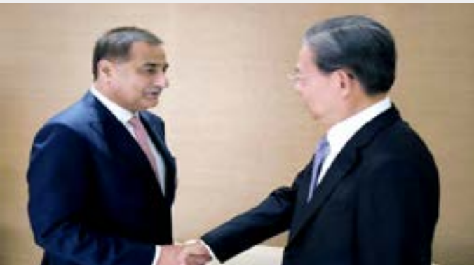
Speaker National Assembly Sardar Ayaz Sadiq met with Chairman of the Standing Committee of China's National People's Congress Mr. Zhao Leji on the sidelines of the 6th World Conference of Speakers of Parliament being held on 29th July, 2025 at Geneva.