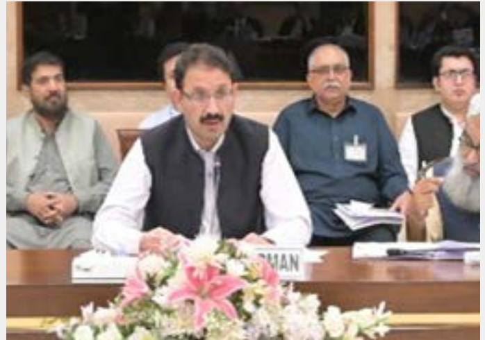
Chairman PAC Mr. Junaid Akbar chairing the committee meeting at Parliament House on 16th July, 2025.

From May 1st, 2025 to July 31st, 2025, the PAC recovered Rs. 11,350.58 million, reflecting its effectiveness in ensuring fiscal soundness.