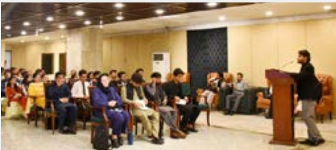
Participants attending a training session organized by the National Assembly of Pakistan to enhance professional skills and parliamentary knowledge.

As part of the National Assembly Strategic Plan 2019–23, a decision was made to take steps to enhance and promote citizen participation. To achieve this, a comprehensive Youth Engagement Plan was introduced, which included the induction of high-caliber graduates and the launch of regular internship programs across various sections of the Secretariat.