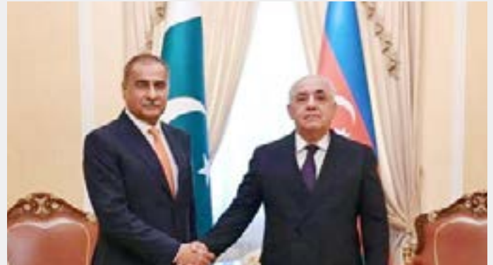
Speaker National Assembly Sardar Ayaz Sadiq shaking hands with the Prime Minister of Azerbaijan, Mr. Ali Asadov on 9th July, 2025 at Cabinet of Minister in Baku, Azerbaijan.