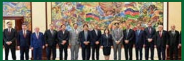
Strengthening Inter-Parliamentary Ties: Pakistan's Parliamentary Delegation Visits Azerbaijan Baku, 6th to 9th July, 2025