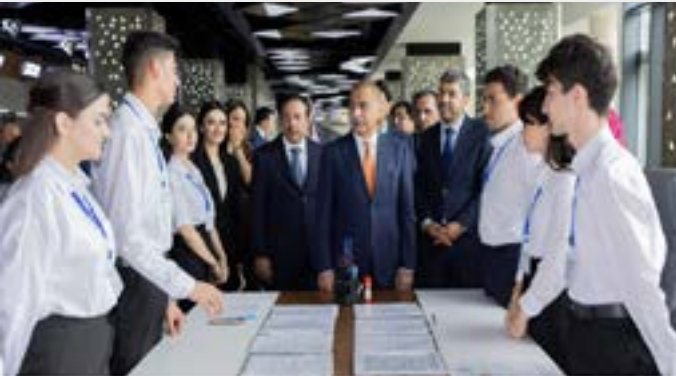
Pakistan's Parliamentary Delegation led by Speaker National Assembly Sardar Ayaz Sadiq receiving a briefing from the Officials of ASAN Service on 8th July, 2025 at Baku, Azerbaijan.