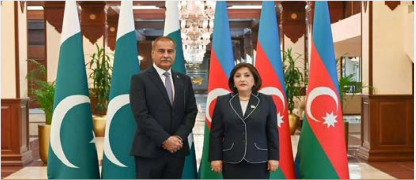
The Speaker National Assembly of Pakistan Sardar Ayaz Sadiq met with the Speaker of the Milli Majlis of Azerbaijan, Sahiba Gafarova in Baku, Azerbaijan on 7th July, 2025

A parliamentary delegation from Pakistan, led by Honourable Speaker National Assembly Sardar Ayaz Sadiq, paid an official visit to the Republic of Azerbaijan, where it engaged in a series of high-level meetings with the leadership of Azerbaijan, including Speaker of the Milli Majlis, Sahiba Gafarova, President Ilham Aliyev, and Prime Minister Ali Asadov. The visit reinforced the deep fraternal bonds between the two nations and advanced inter-parliamentary cooperation, regional connectivity, and strategic collaboration.