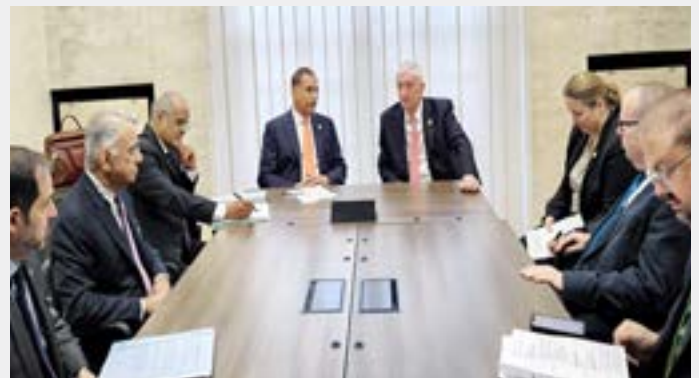
Speaker National Assembly Sardar Ayaz Sadiq in a meeting with Speaker of the UK House of Commons Sir Lindsay Hoyle on the sidelines of 6th World Speakers Conference on 31st July, 2025 at Geneva.