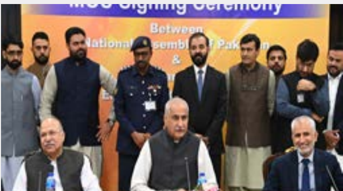
Speaker National Assembly Sardar Ayaz Sadiq chairing MoU signing ceremony between Pakistan National Assembly Secretariat and Allied Bank on 25th June, 2025 at Parliament House.