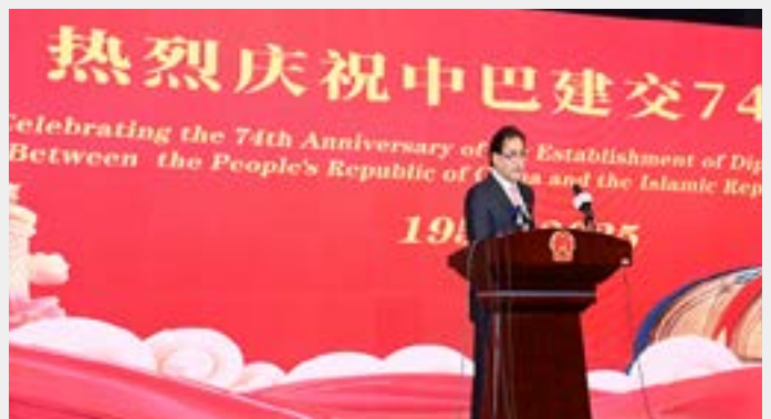
Speaker National Assembly Sardar Ayaz Sadiq addressing the participants of Celebrations of 74th Anniversary of establishment of Diplomatic Relations between China and Pakistan on 21st May, 2025 at Parliament House.