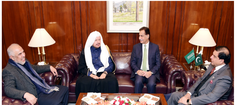
Speaker National Assembly, Sardar Ayaz Sadiq with two former Speakers, Raja Pervaiz Ashraf and Mr. Asad Qaiser met with special guest, Chairman of Shura Council of the Kingdom of Saudi Arabia, Dr. Abdullah Bin Mohammed Bin Ibrahim Al Sheikh at the Parliament House, Islamabad.