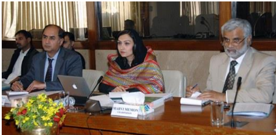
Ms. Marvi Memon, Chairperson Standing Committee on Information, Broadcasting & National Heritage Chairing the Committee meeting at Parliament House on 13.03.2014.

Over 35 speakers, Linguists, Experts and Academia had been invited from all over Pakistan for their valuable input on the subject. Balochi, Balti, Brushaski, Brahui, Hindko, Khowar, Kashmiri, Pahari, Pashto, Punjabi, Saraiki, Shina, Sindhi and other Mother Tongues were amply highlighted from participants representing the diverse areas of Pakistan.